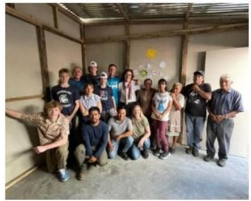
February 2023 Vision Team - Home Dedication